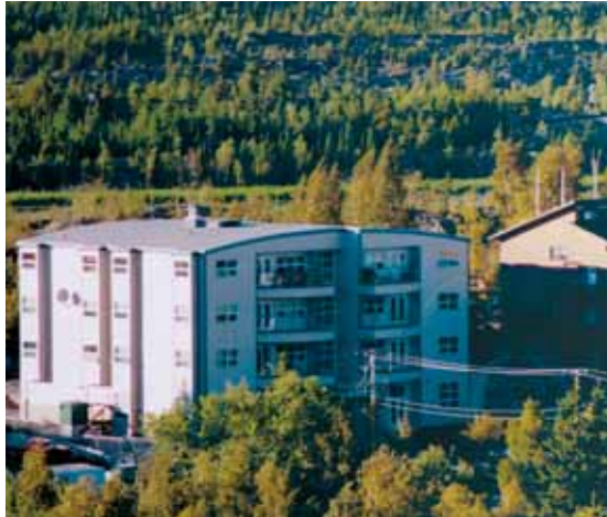
Denendeh Manor in Yellowknife