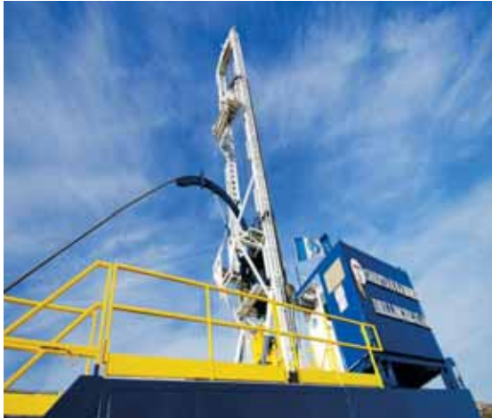
Shehtah Nabors operates conventional and coil tubing drill rigs.