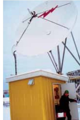
All NWT communities now have high speed internet