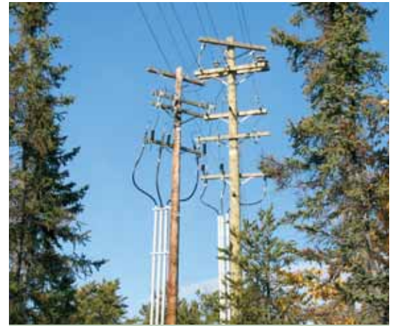
DII's ownership interest in Northland Utilities is an investment in essential NWT services.