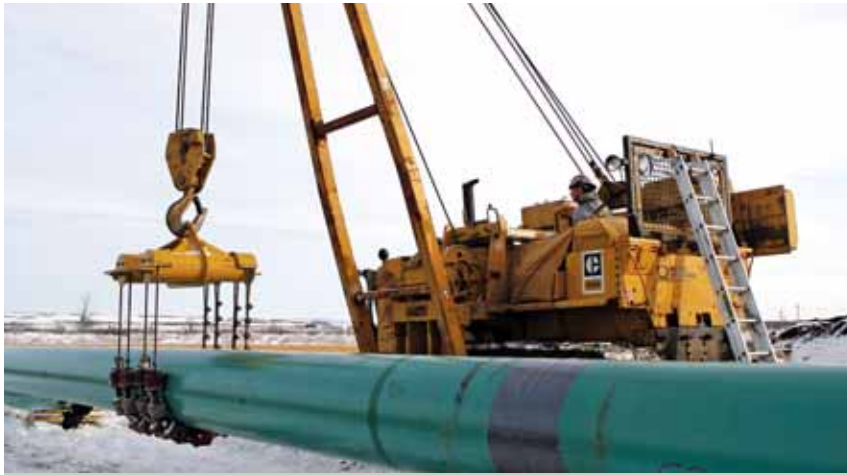
The Mackenzie Aboriginal Corporation has the capability of building a significant portion of the proposed Mackenzie Valley pipeline and related facilities.